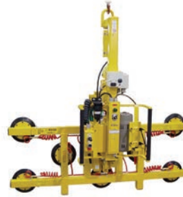
Manual Rotator/Power Tilter (AC) 1000 (AC) ..... MRPT89AC