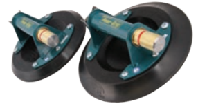
Vacuum Hand Cups 8" Flat – ABS (plastic) handle – 125 lb..... GN4000 8" Flat – metal handle – 125 lb ..... GN4950 9" Flat – metal handle – 150 lb ..... GN5450 10" Concave – metal handle – 175 lb..... GN6450

Ask about our Wood's cup exchange program.