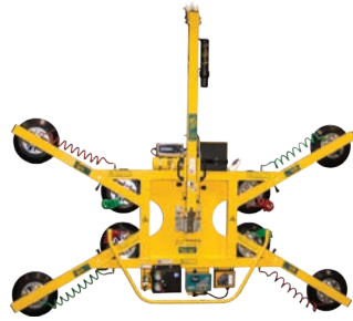
Low-Profile Manual Rotator/Tilter 1100 (DC) w/ Intelli-Grip™ ..... MRTALP811LDC3