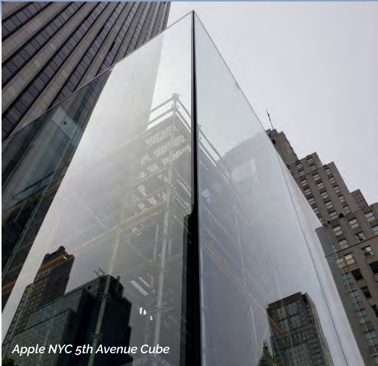
Apple NYC 5th Avenue Cube