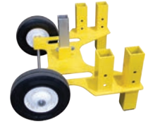
MRT Dolly ..... 98790