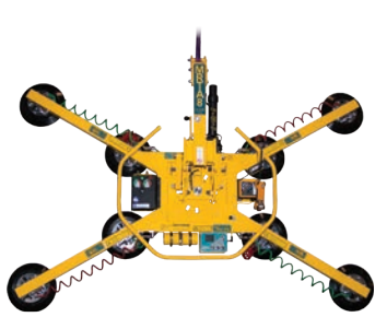
Quadra-Tilt™ Rotator 1400 (DC) w/ Intelli-Grip™ ..... MRTA811LDC3