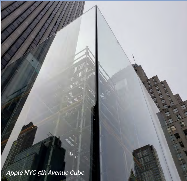
Apple NYC 5th Avenue Cube